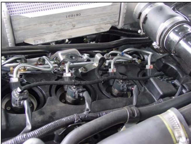
Rocker Cover ZD30DDTi CRD (2007)