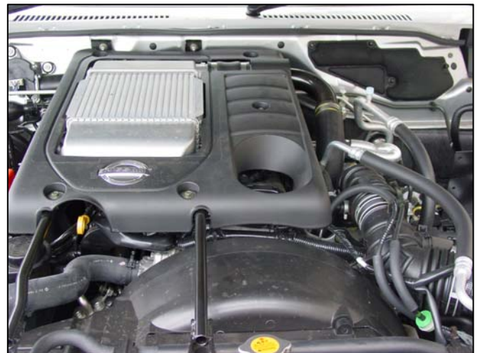
ZD30DDTi (CRD; 2007)