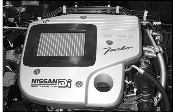
ZD30DDTi (Non CRD; 2000 ~ 2006)

Note 5; ZD30 engine also applied to D22 Navara models from late 2001 ~ 2006 production. Engine has a conventional turbo, but no intercooler. (ZD30DDT)