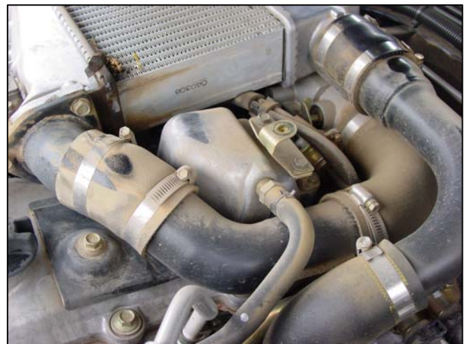
Rocker Cover ZD30DDTi (2000 ~ 2006)