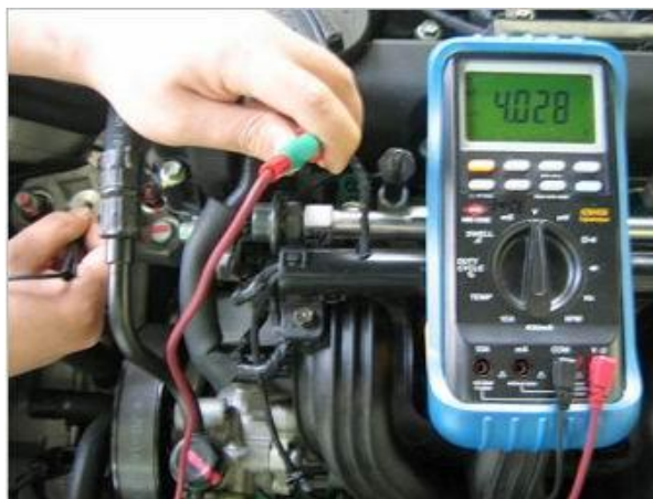
[Wiring inspection-control line]