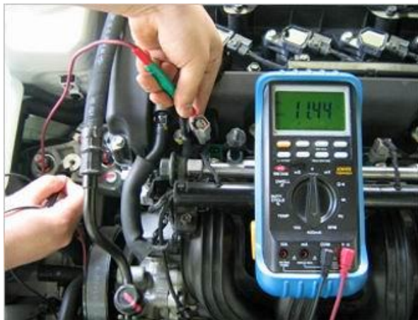
[Wiring inspection-power supply]