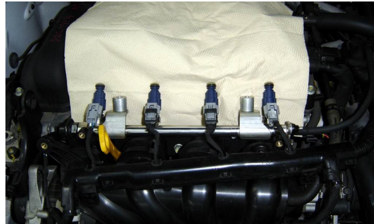
[Injection test-visual inspection]