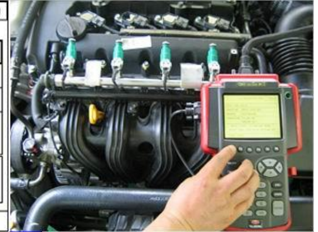
[Injector leak test]