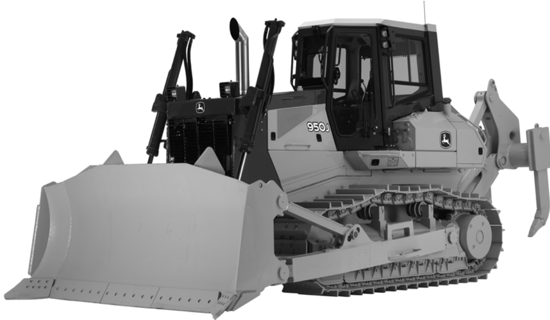
SIDE VIEW OF JOHN DEERE 950J CRAWLER BULLDOZER (MANUFACTURED 2006- )