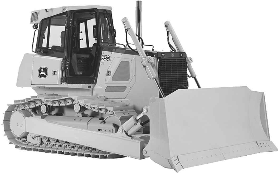
RIGHT SIDE VIEW OF 850J TIER III CRAWLER (MANUFACTURED 2006- )