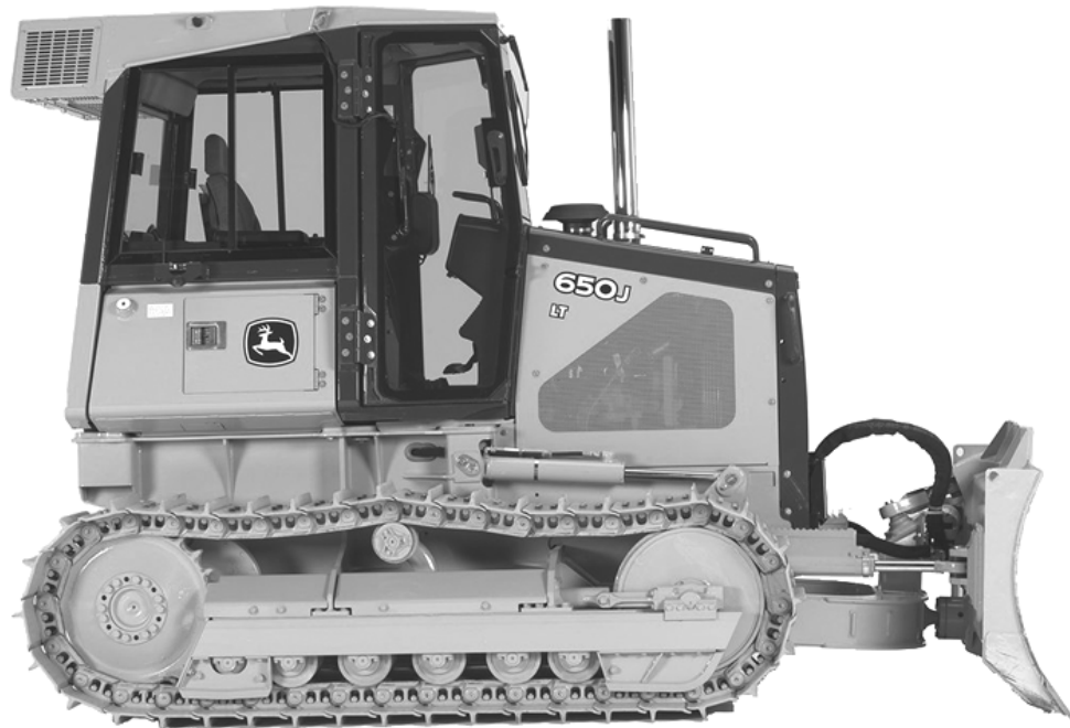
RIGHT SIDE VIEW OF 650J CRAWLER (MANUFACTURED 2004- )