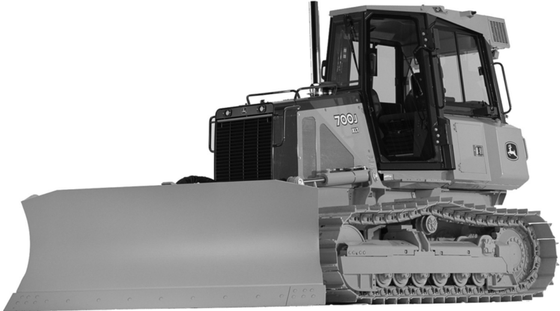
LEFT-HAND SIDE VIEW OF 700J CRAWLER (MANUFACTURED 2005- )