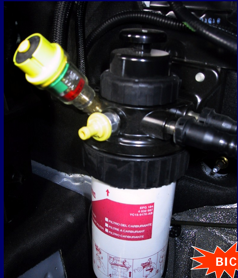
Oil filter indicator