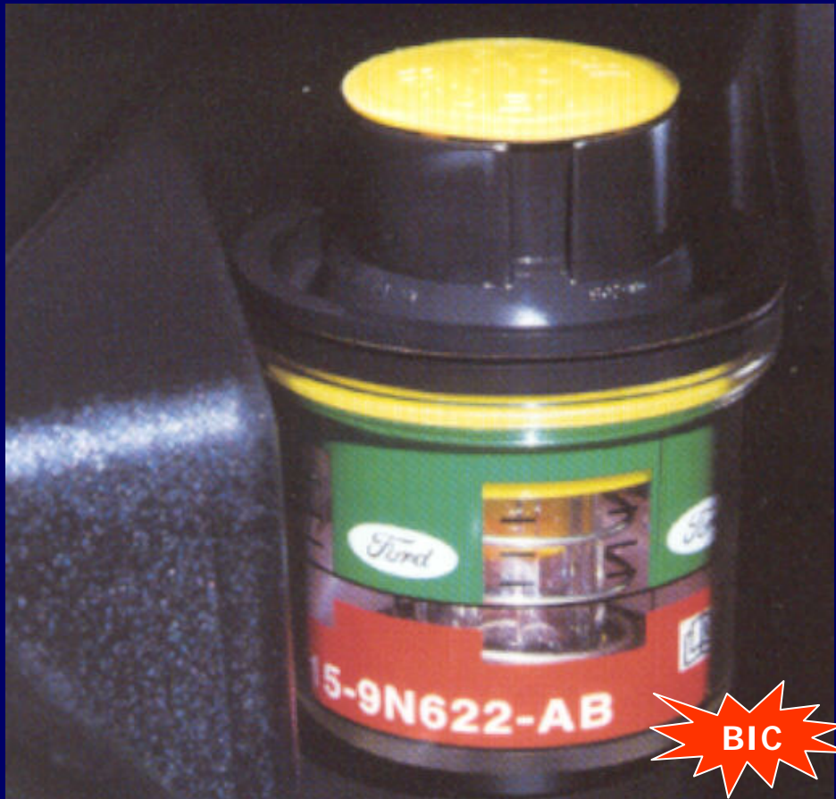
Filter change indicator