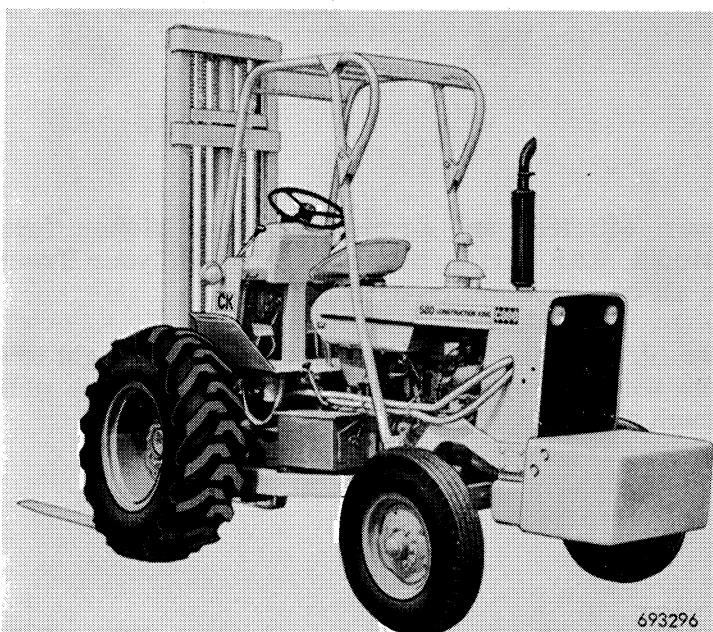
Figure 2 - Power Shuttle Fork Lift With 21' Mast